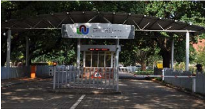
Entrance Gate, Building C1, North-West University